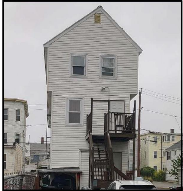
Right: Right Elevation