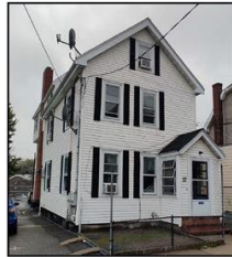
17 Allen Street

The HPC need to make determinations of whether the structure is to be preferably preserved and adopt findings.