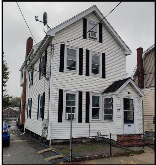
Right: Left Elevation